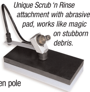
Unique Scrub 'n Rinse attachment with abrasive pad, works like magic on stubborn debris.